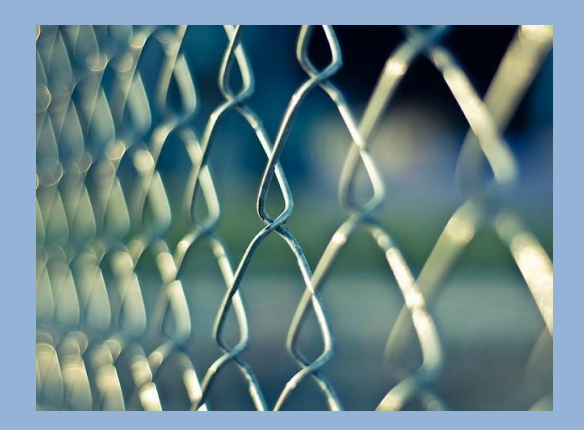
Non-tariff barriers are some of the most prolific barriers to intra-Africa trade.