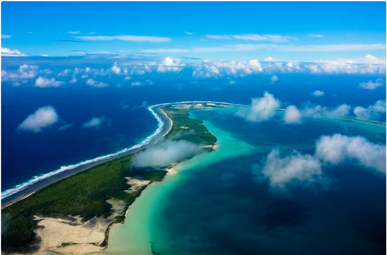
The edge of Diego Garcia flying out

A window is fast closing to resolve Mauritian claims to the Chagos archipelago and secure a crucial US base.