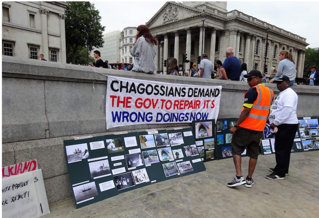
A demonstration in Trafalgar Square, London, over the Chagos Islands, July 2018

For decades, Australia has given unquestioning support for Britain’s position on sovereignty, therefore to the legitimacy of the US base on Diego Garcia. But perhaps we should ask how long we can afford to ignore Mauritius’ claims . Indeed, there is a danger that the longer the dispute goes unresolved the more entrenched Mauritian claims may become. But there may be a window to reach a negotiated solution that gives Mauritius most of what it seeks while also allowing the US base to continue for the foreseeable future.