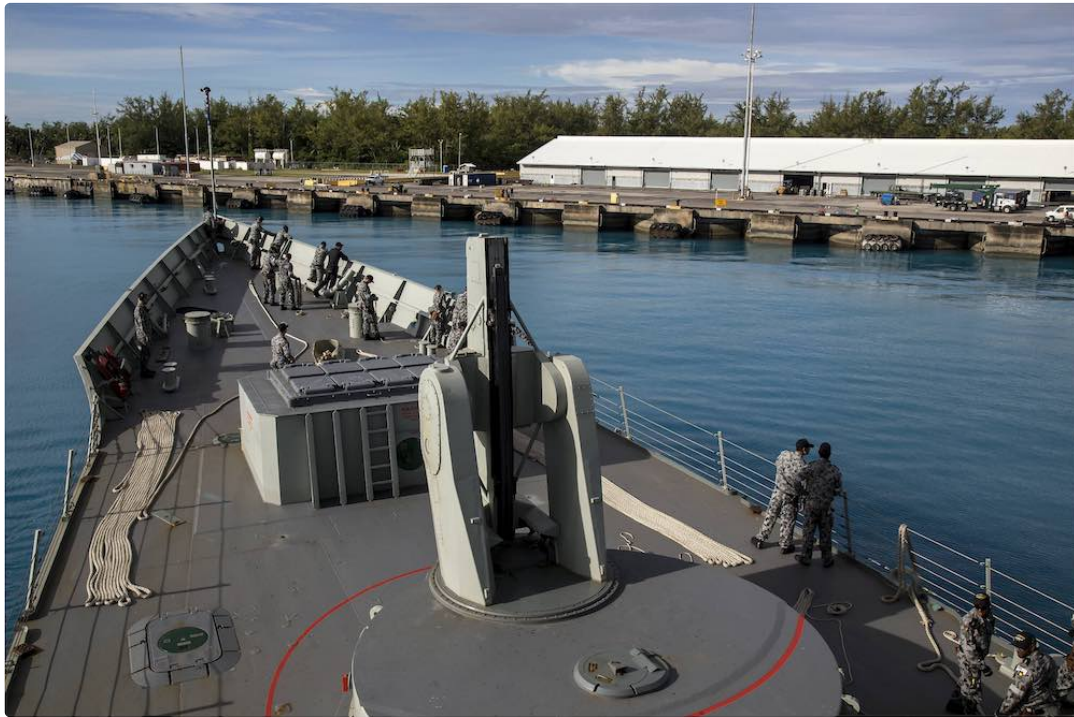
HMAS Newcastle approaches the wharf at Diego Garcia, British Indian Ocean Territory, in 2015

For its part, Mauritius has long focussed on trying to persuade London about the question of sovereignty. But it has not substantively engaged with the United States, which is the real party in interest. One wonders how long Britain would hang on to the Chagos if the United States didn't need the base.